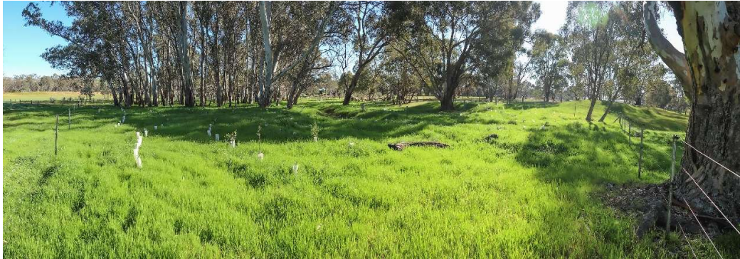
Point 1 - View North East – 1/10/2019

Point 1 - 37.063411 South 144.165988 North Southern end of the planting area