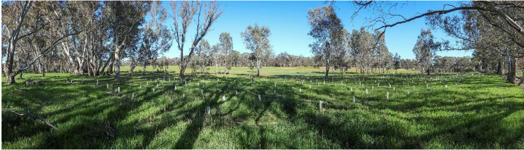
Point 3 - Panorama West 180 deg – 1/10/2019

Point 3 - 37.062398 South 144.165929 North West side of Basset Creek looking west