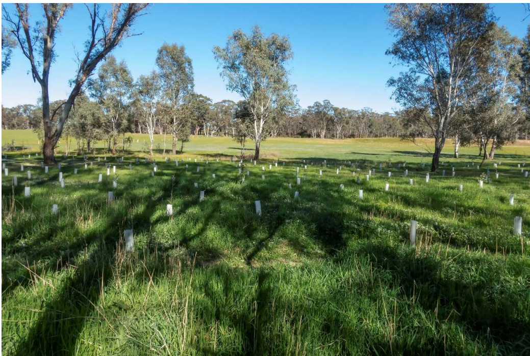
Point 3 - View South to North sequence – 1/10/2019