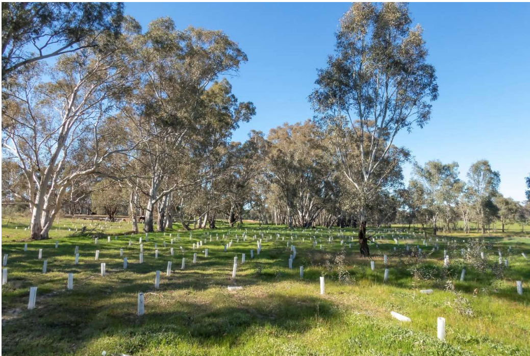
Point 2 - View South – 1/10/2019