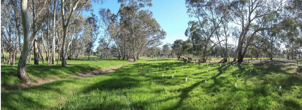
Point 4 - Panorama North 180 deg – 1/10/2019

Point 4 - 37.063147 South 144.166047 North East side of Basset Creek looking north