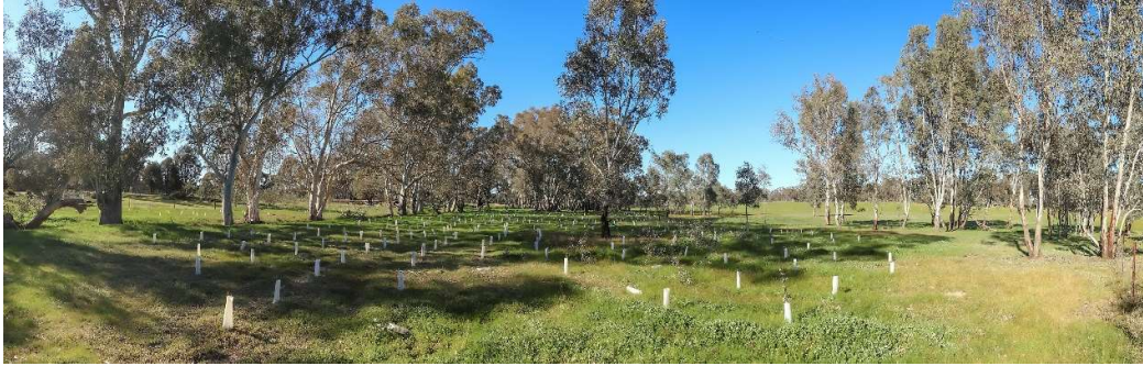
Point 2 - Panorama South fence to fence – 1/10/2019

Point 2 - 37.062044 South 144.165769 North Northern end of the planting area