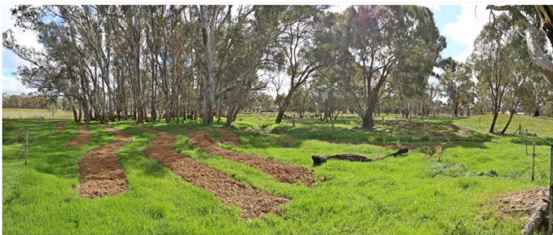
Point 1 - View North East - 20180915