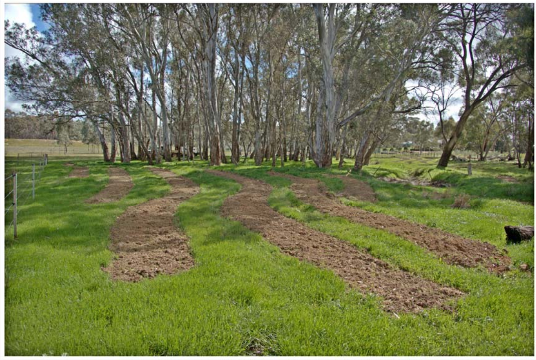
Point 1 - View North East - 20180915