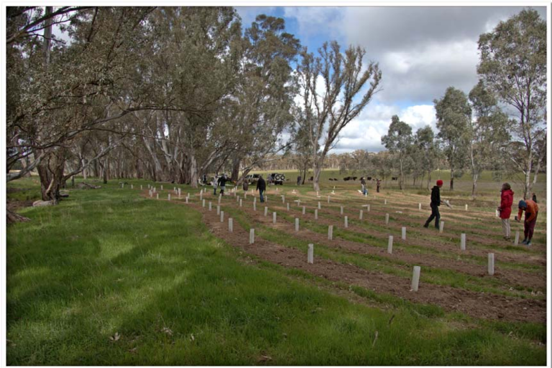
Point 3 - View South to North sequence - 20180915