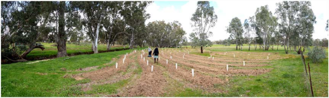
Point 2 - Panorama South fence to fence - 20180915