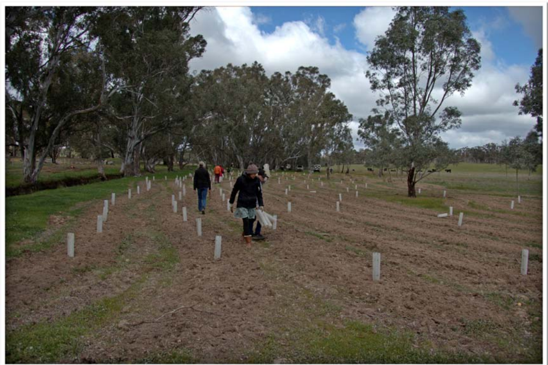
Point 2 - View South - 20180915