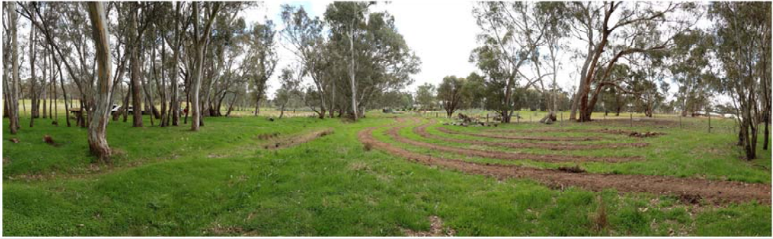
Point 4 - Panorama North 180 deg - 20180915

Point 4 - 37.063147 South 144.166047 North East side of Basset Creek looking north