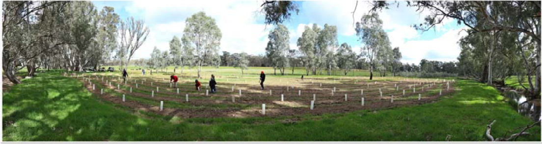
Point 3 - Panorama West 180 deg - 20180915

Point 3 - 37.062398 South 144.165929 North West side of Basset Creek looking west